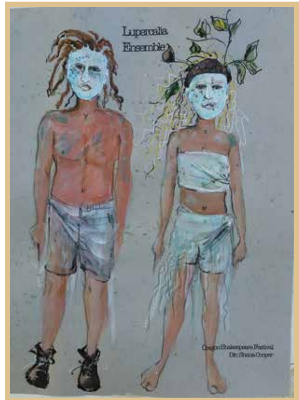
2017 Julius Caesar costume renderings for Ensemble by Raquel Barreto.

https://www.britannica.com/topic/Lupercalia