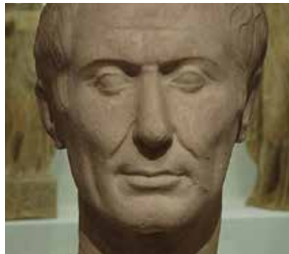
Roman sculpture of Julius Caesar