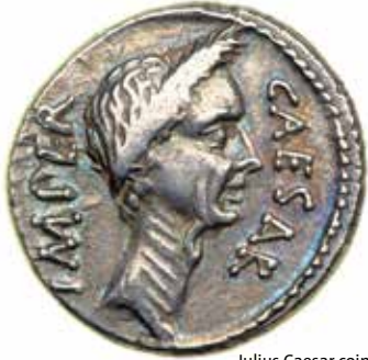
Julius Caesar coin 44 BC