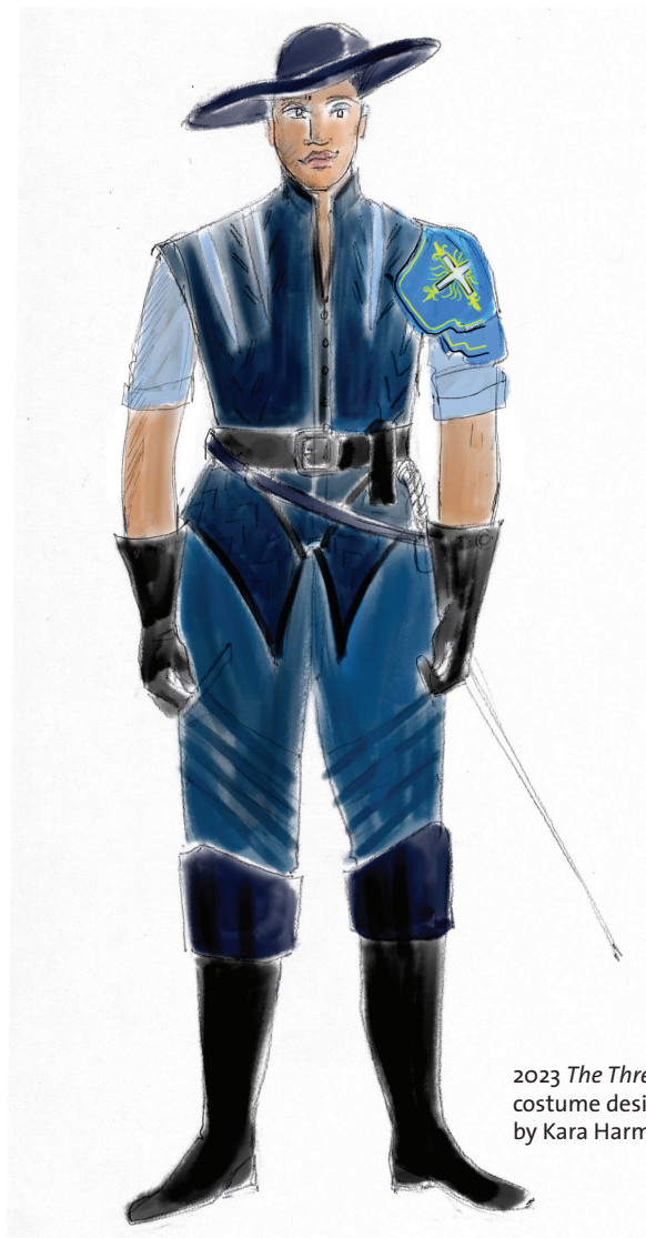
2023 The Three Musketeers costume design for Aramis by Kara Harmon.