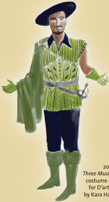
2023 The Three Musketeers costume design for D'artagnan by Kara Harmon.